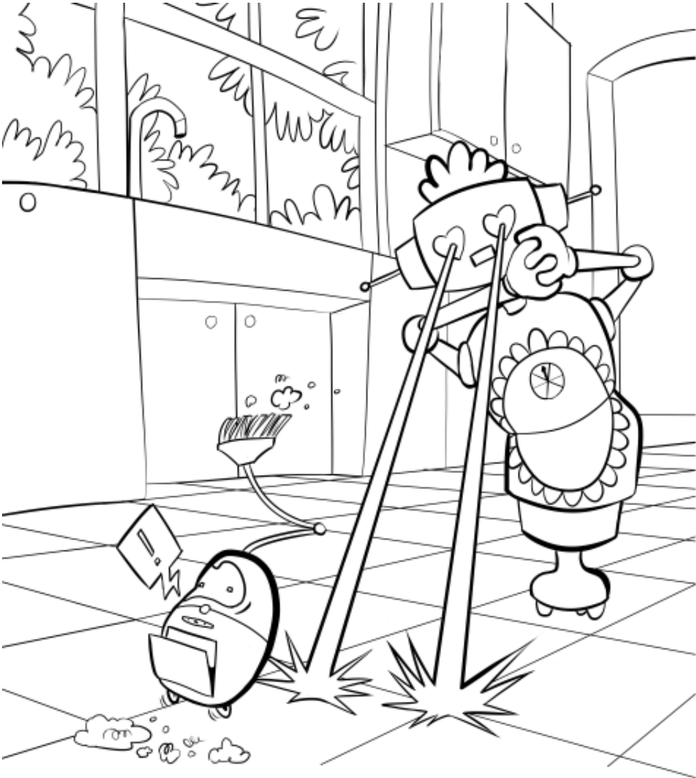
Use your words, not your laser eyes.