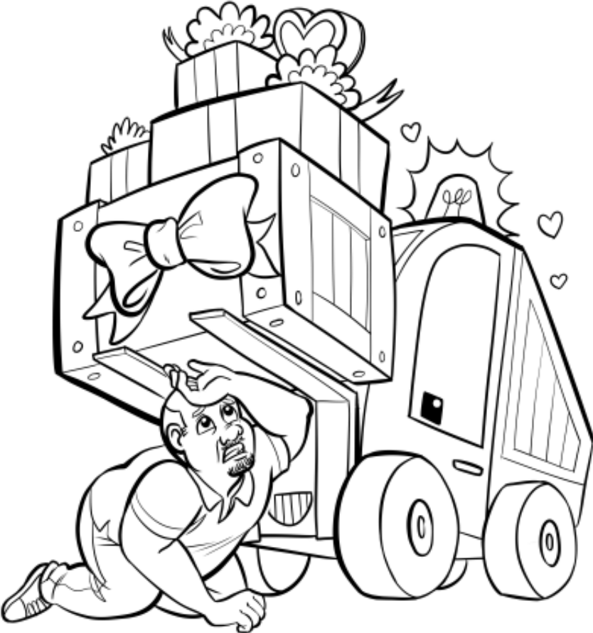
Do not take the word "crush" literally.