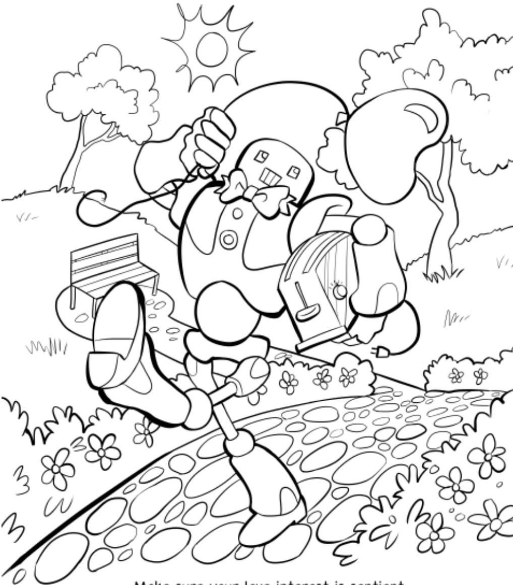
Make sure your love interest is sentient.